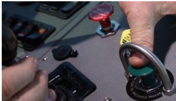
Figure 1: Fifth wheel unlatch button activation

To insure proper operation press the unlatch button for 3 seconds. When the unlatch button is pressed (Figure 1), the fifth wheel opens, moving the lock jaw across the throat and “setting up” for the next couple (Figure 3). If you continue to hold the button down during the coupling process, the fifth wheel will not latch properly.