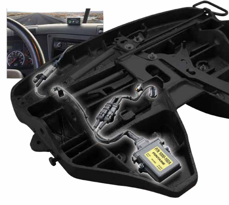
Figure 2: LST Fifth Wheel

Coupling display box with the 31 foot wire (display to fifth wheel connection), a 5.5" long M12 to 4 Pin Deutsch DT coupler cable is also included.