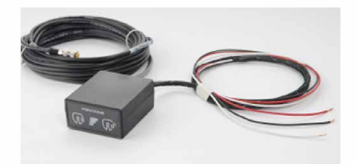
Figure 3: LST display box