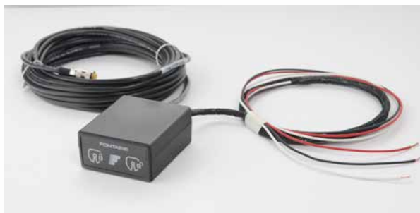
Figure 3: SmartLock display box