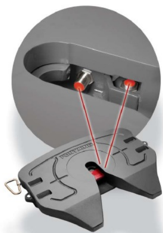
Figure 2: SmartLock fifth wheel