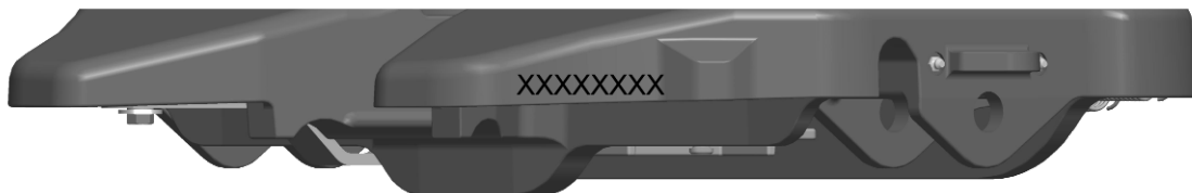
Figure 1: New style (after 11/27/2000) serial number location

Serial number engraved directly into the right side of fifth wheel skirt.