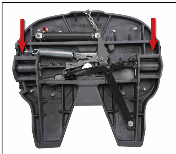
Figure 2: Underside view, Lubrication points of Fontaine Armor