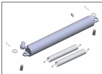
No-Slack® KIT-AA-6000L currently includes the JEV-F4M4 valve.