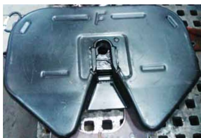
Figure 1: Image of an Ultra LT fifth wheel