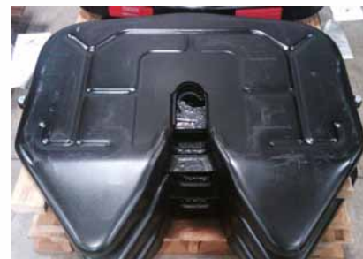
Figure 2: Image of a No-Slack® II NT fifth wheel